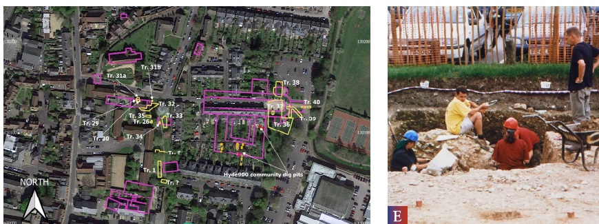
Map of excavations showing the 1995-99 and 2016-18 trenches (yellow) together with outlines of the predicted buildings (purple). The revised plan of the cloister based on the findings of the 2016-18 digs.