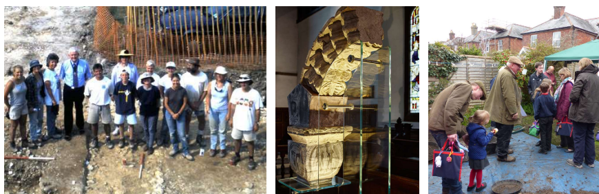
1999 Team One of the community volunteers in the excavated side chapel.