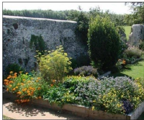
Lewes Priory Herb Garden