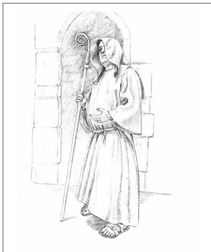
13th Century Abbot Aston (Drawing by Alex Jones)

This is an ambitious programme. It needs the support of local people. To register your interest please go to www.hyde900.org.uk and look for the 'Hyde Abbey King Alfred project - Have Your Say'